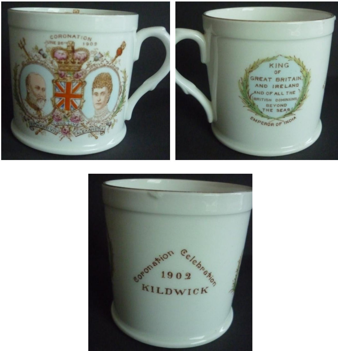
Figure 3: The 1902 commemorative mug